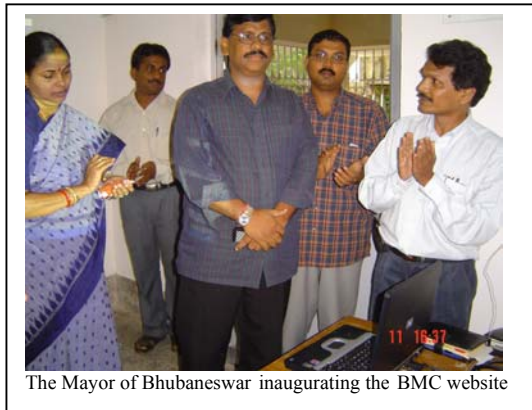
The Mayor of Bhubaneswar inaugurating the BMC website