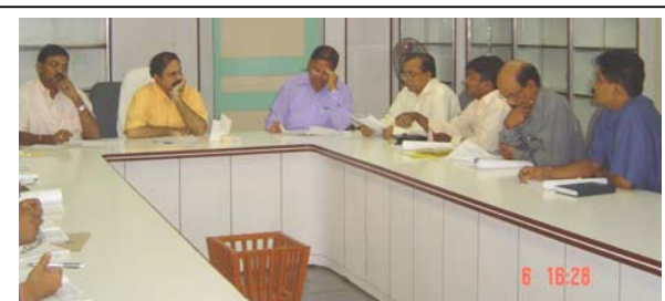
Managing Committee in progress Chaired by President CMAO