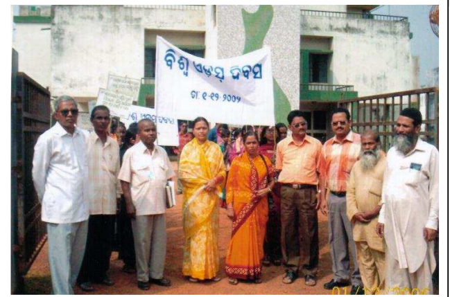
World AIDS Day Awareness campaign in Jatani, Town by Jatani Municipality

Similarly in Jatani Municipality both awareness workshop-cum-rallies were organized with participation of chairpersons, executive officers etc. Various programmes were also organised by Puri Municipality in Holy city of Puri. The city of Puri is not only important for religious purpose but also famous for tourist destination of India.