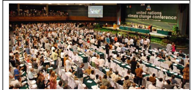
Participants at the Bali Conference