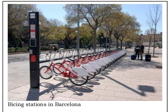
Bicing stations in Barcelona

In March 2007, the city of Barcelona instituted a new shared transit system to facilitate access and efficiency amongst the existing network of public transportation known as Bicing. The Bicing deployed 200 hundred sharable bicycles to 14 bike stations around the city, and activated an interactive website that allows users to track the availability of bikes in real-time, as well as to look up the proximity of stations from wherever they are.