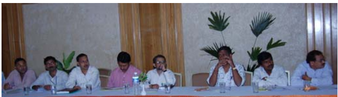
Participants at the WHD Workshop