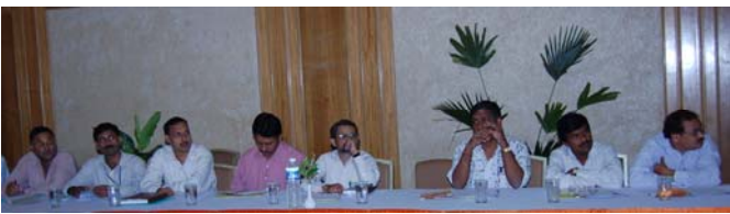
Participants at the WHD Workshop