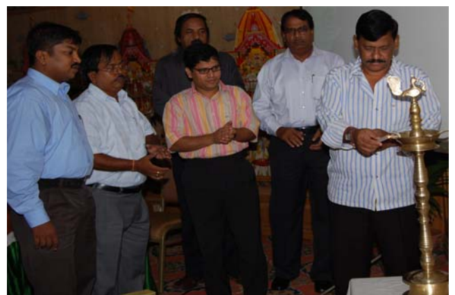
Inaugural Session of the WHD Workshop

Far away from The Hague City, Netherlands the City Mangers' of Orissa, India celebrated World Habitat Day (WHD) at Bhubaneswar on 1st October 2007. This year the main function was held in Hague, Netherlands. The