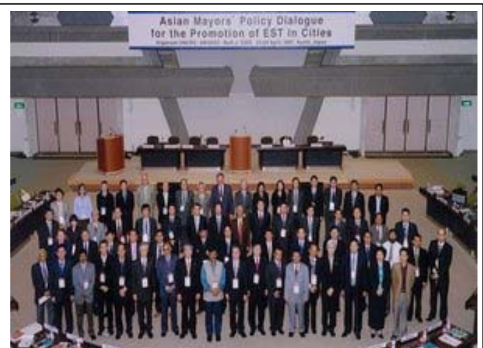
Participants of the Policy Dialogue in Kyoto, Japan

City Mayors and international experts gathered at the "Asian Mayors' Policy Dialogue for the Promotion of Environmentally Sustainable Transport (EST) in Cities" on 23-24 April 2007, Kyoto, Japan.