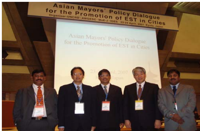
Representatives from Bhubaneswar & Bangalore City with UNCRD team.

During the two-day meeting, 25 mayors from Japan, South Korea, China, India, Thailand and other Asian nations, as well as delegates from international and regional organizations hold discussions on how to solve the environmental and social challenges in urban transportation and share practices and information. As an outcome of the dialogue, the Kyoto Declaration was adopted by the city mayors towards further promotion of EST through city level action plans and programmes.