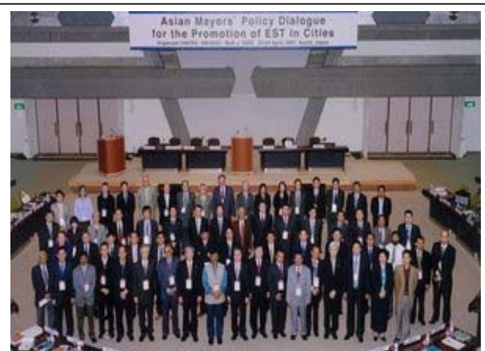
Participants of the Policy Dialogue in Kyoto, Japan

City Mayors and international experts gathered at the "Asian Mayors' Policy Dialogue for the Promotion of Environmentally Sustainable Transport (EST) in Cities" on 23-24 April 2007, Kyoto, Japan.