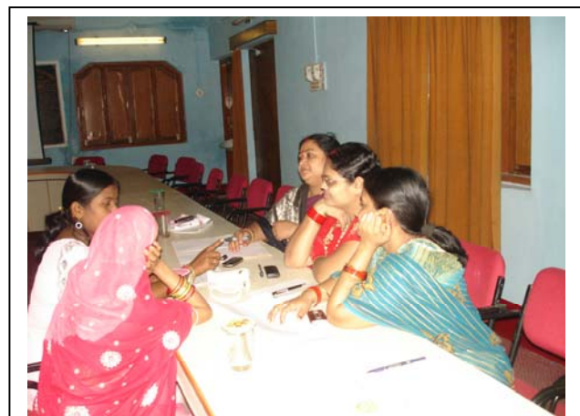
Group Discussion during training programme