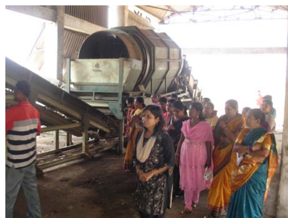
Participants on a field visit to Puri SWM Plant