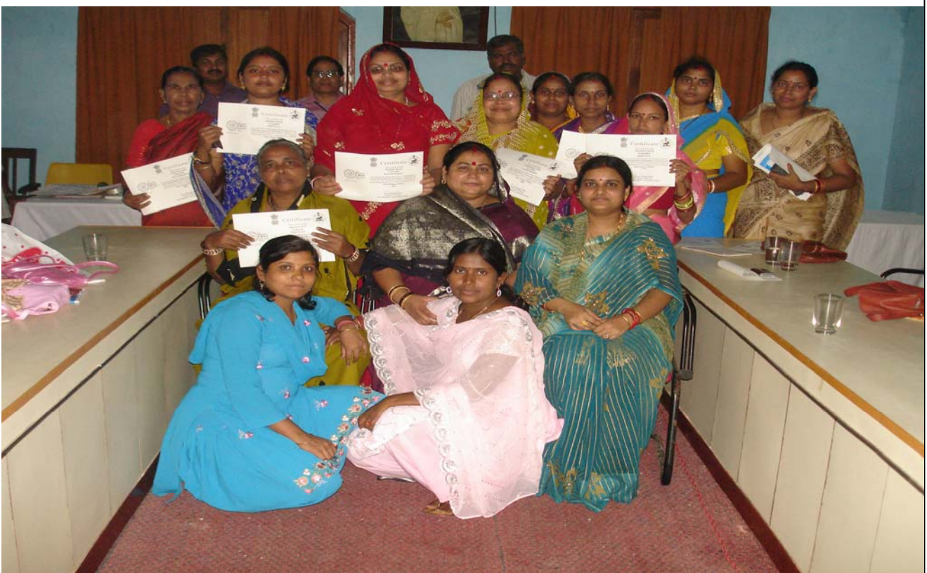
Participants along with Resource Persons of the Women Councilors Training Programme in Puri

Participants for the first time learned on subjects like global warming, climate change, urban transport and gender perspectives in urban planning processes. At the end of the Programme, participants presented their action plans and shared their feedback during the Evaluation Session.