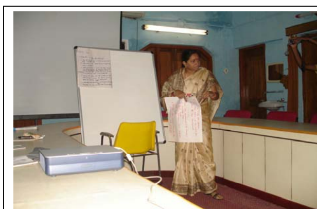
Participants presenting Action Plans