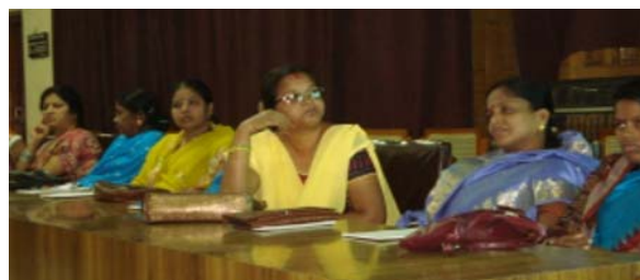
Participants during training programme