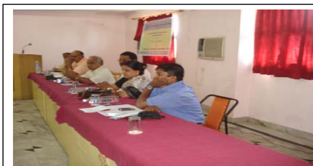
Training programme in Berhampur

Slides from the Sustainable Urban Development