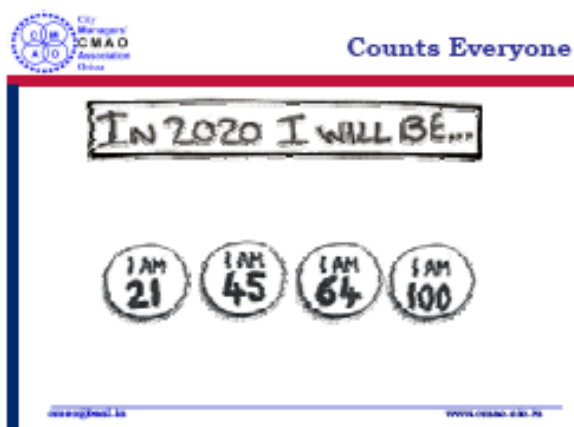
Slides from City Development Plan