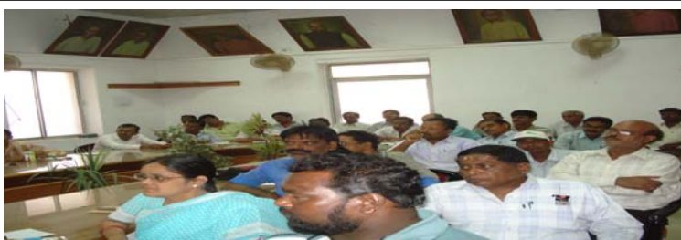
Participants of training programme