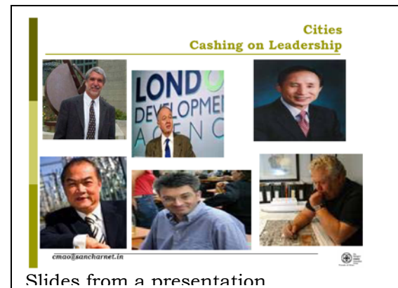
Slides from a presentation