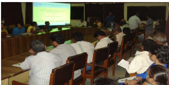
Participants during training programme