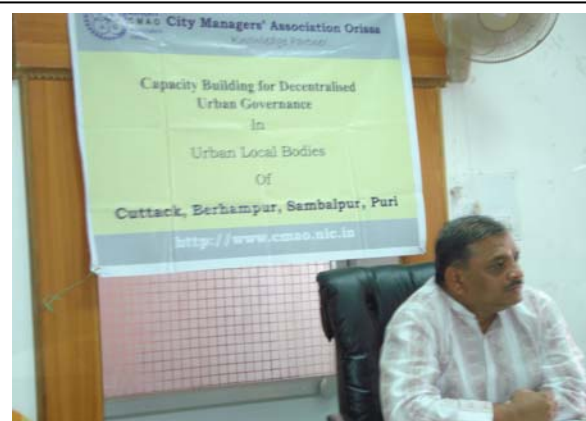
Chairperson of Sambalpur Municipality during training programme